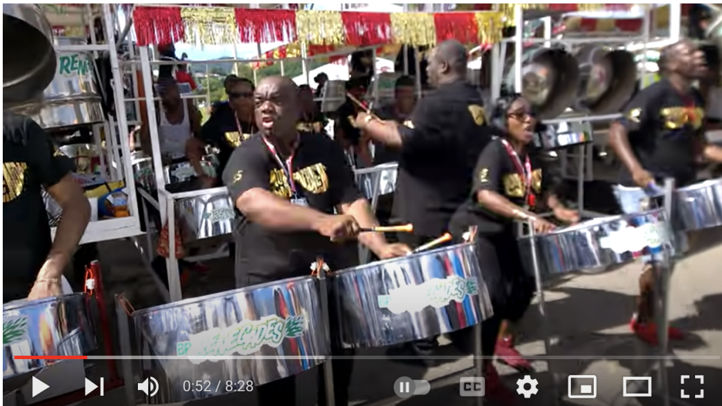
Now, watch the BP Renegades Steel Orchestra play “Like Ah Boss” at the International Panorama Competition in Trinidad & Tobago!