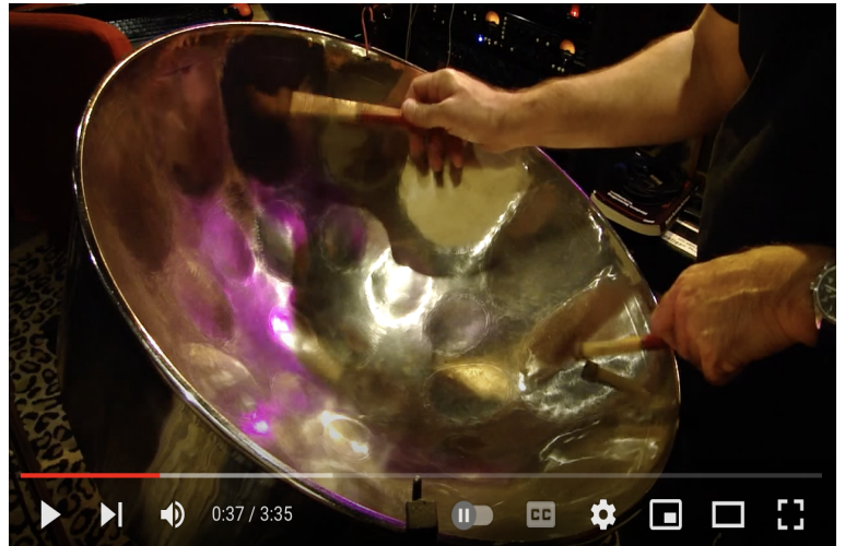
Watch a demonstration of the Steel Pan Here .