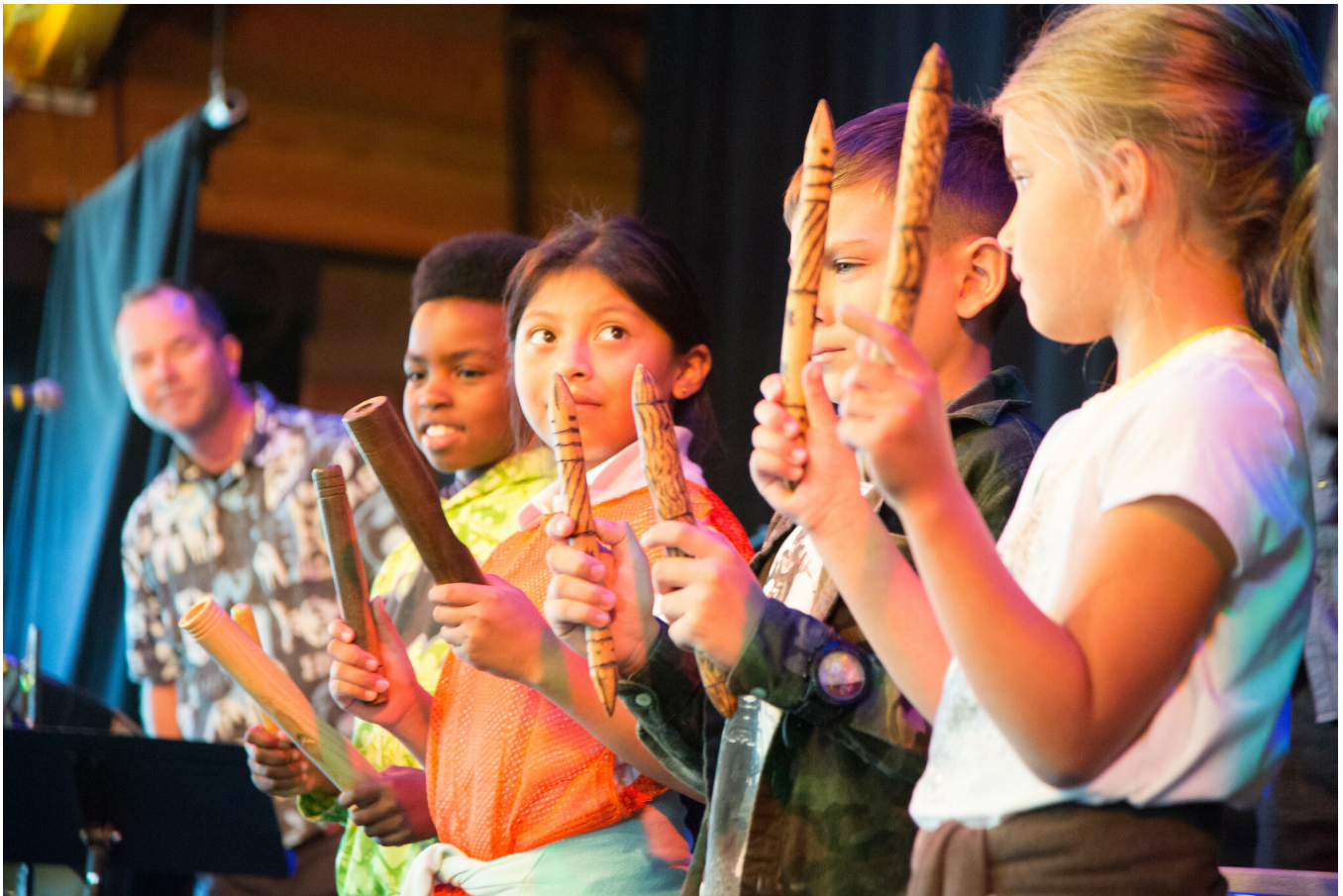
Caribbean Express at Rhythmix Cultural Works, 2019.

We look forward to seeing you next time!