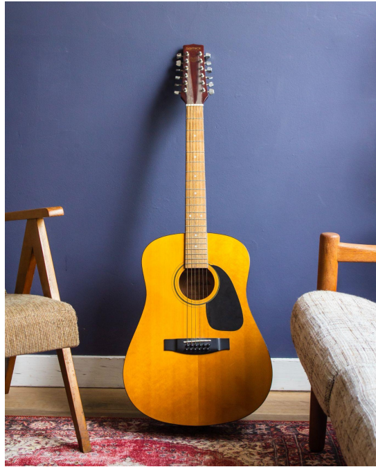
Photo of guitar

The guitar is a stringed musical instrument, with a fretted fingerboard, typically in-curved sides, with 6 or 12 strings. It's played by strumming with fingers or a guitar pick.