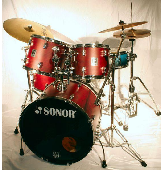
Image: Drum-Set (made by Sonor), Cymbals by Headliner and Paiste. Photo by Stephan Czuratiss (Jazz-face).( License Agreement )

The drum kit , also called a drum set , or drums , is a collection of drums and other percussion instruments, typically cymbals, which are set on stands to be played with sticks held in both hands, and the feet operating a kick-drum pedal and a high-hat pedal.