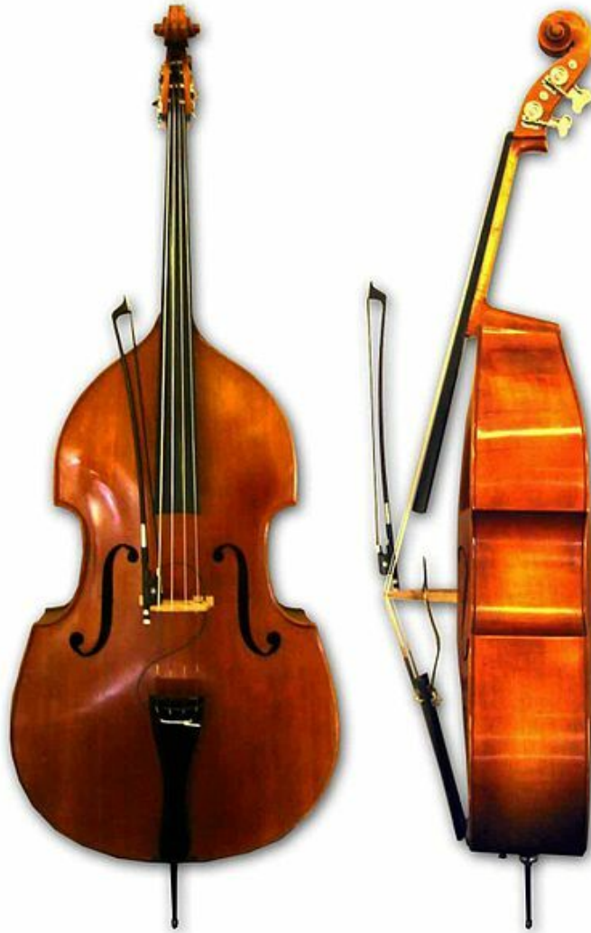
Double bass front and side

Upright bass is a name for a large stringed instrument, also called contrabass and double bass. It plays low-pitched notes in musical ensembles and bands. In jazz bands, these notes are called the "bass line." ( https://kids.kiddle.co/Double_bass )