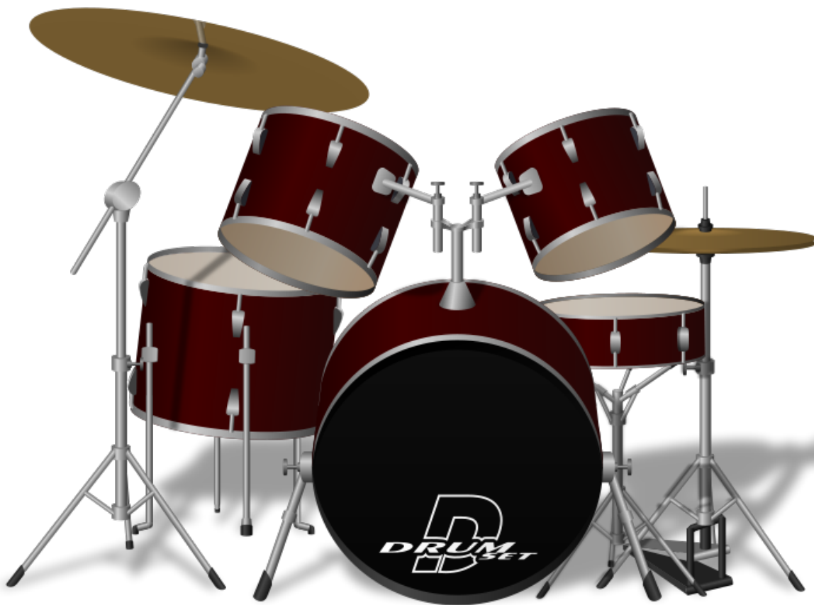
Standard Drum Set

A drum set is a collection of drums and cymbals that is played with both hands and both feet to create many rhythms at the same time.